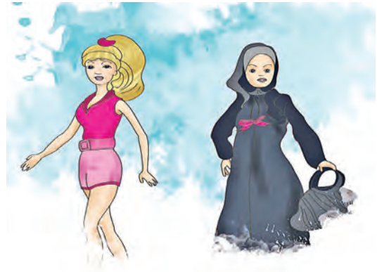
Hybrid version of Barbie