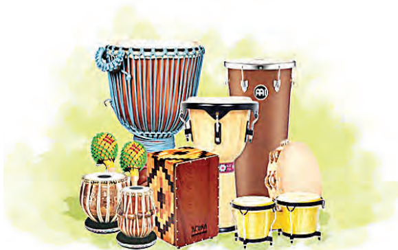
Examples of material culture

Non-material culture: Non-material culture refers to ideas created by human beings. The nature of non-material culture is abstract and intangible. For e.g. norms, regulations, values, signs and symbols, knowledge, beliefs etc. Non-material culture is further divided into cognitive and normative aspects of culture. The cognitive aspects refer to understanding as well as, how we make sense of all the information around us. e.g. ideas, knowledge, beliefs. The normative aspects consist of folkways, mores, customs, conventions and laws. These are mainly values or rules that guide social behaviour.